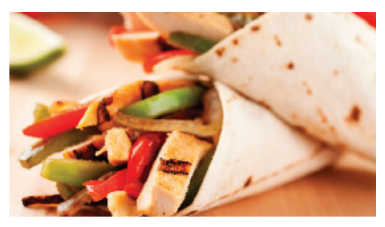
Minimum 25 guests (available until 3pm)